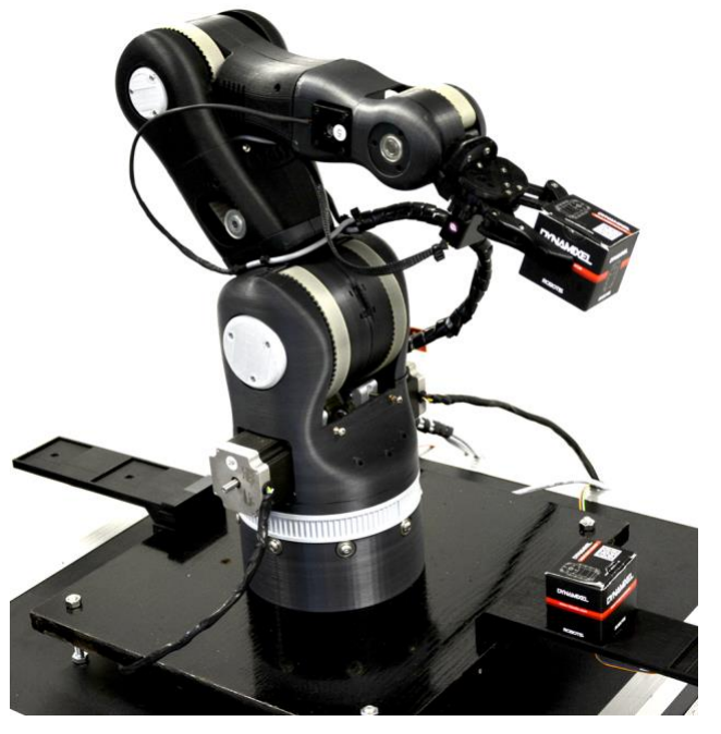
Figure 1 Pilot platform - robotic arm

- System waits for workplace items to be reloaded, to set the availability of service.